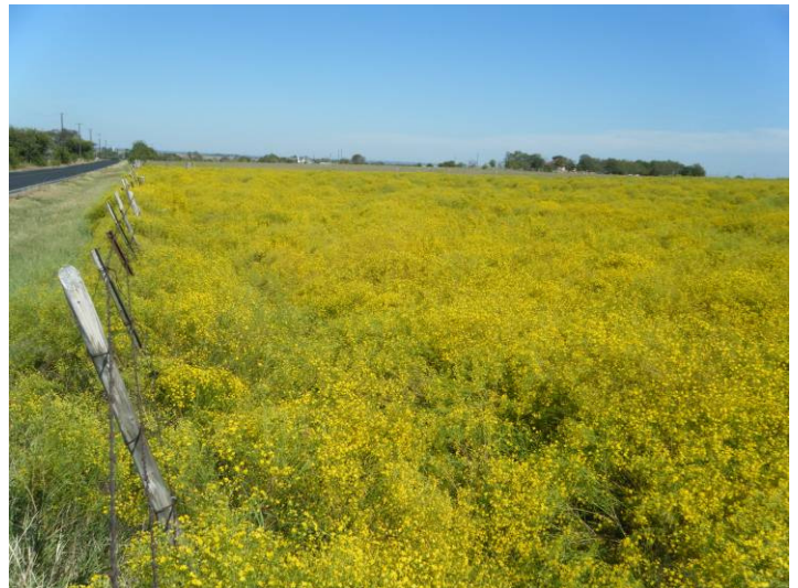
Broom weed in Williamson County

In most situations, the nectar flow in central Texas is over. Some of you may be in an urban setting that still has some nectar flow but for most beekeepers, it is time to start feeding immediately after you harvest. Your goal is to keep the foragers working and the queen laying more eggs for additional workers to go into the winter cluster. That means that if you do not have a natural nectar flow, you have to simulate one by feeding. This time of the year you may want to thicken up the syrup by mixing 1 1/2 to 1 ratio, that is 3 - 4lb bags of sugar to one gallon of water, or at least a 10 lb bag of sugar to one gallon of water. Feeding will replenish some of the honey you may have extracted in addition to acting as a stimulant for brood rearing. If you live in the country and have been blessed by the current rains you may look for Broom weed blooming in your area (round tumbleweed looking plant with small bright yellow flowers) that would offer some hope of a natural honey flow (see picture). Aster and Goldenrod are also fall plants that are beneficial to our bees.