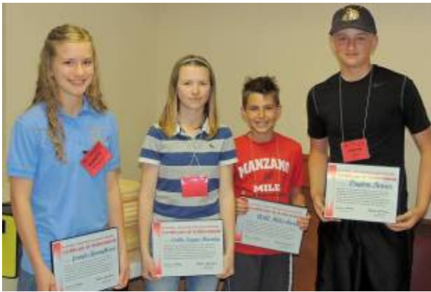
2012 Scholarship Recipients