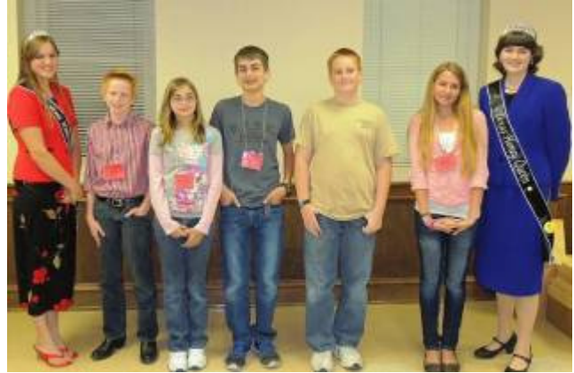
2013 Scholarship Award Winners