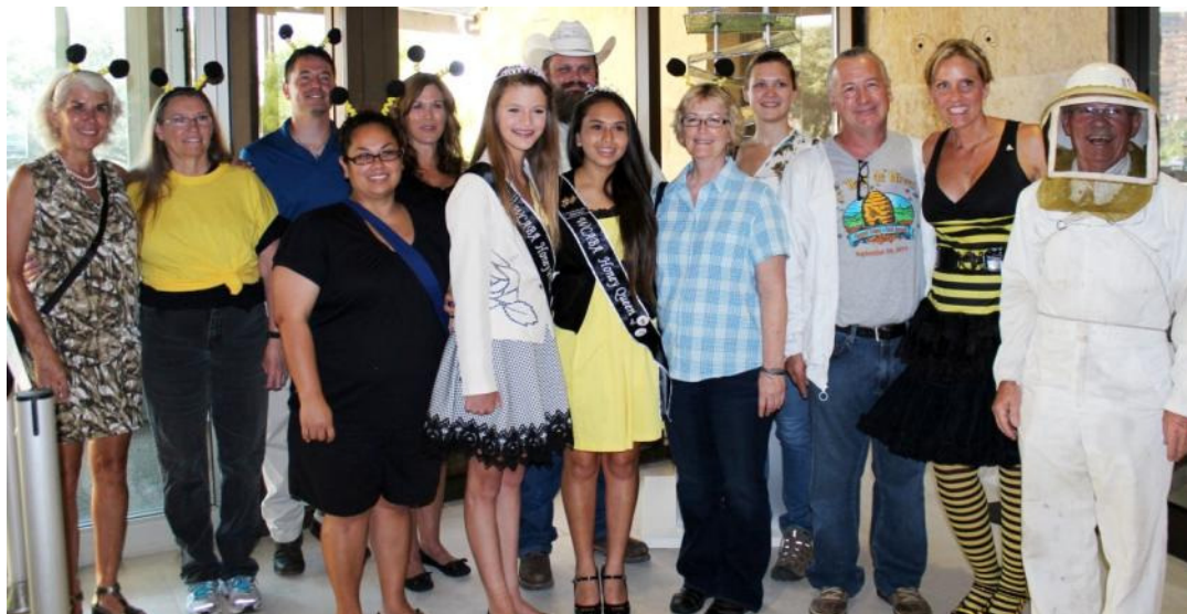
Group at Austin City Council Chambers for Proclamation